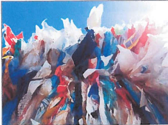
Waste films for recycling

By 2025, France's biggest films manufacturer Barbier (Sainte-Sigolène / France; www.barbiergroup.com ) intends to double the quantity of recycled PE it uses, which currently stands at 25,000 t/y. Managing director Serge Vassal confirmed that the appropriate investments are being made in conjunction with the French government's initiatives on recycling and the use of plastic products – see PIEWeb of 17.08.2018 . Among other things, the company has announced that it has earmarked EUR 3m for renovating the older of two recycling facilities.